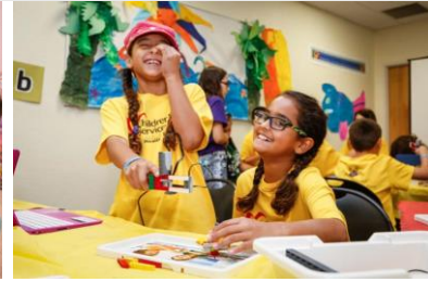
Find the perfect (and affordable) summer camp