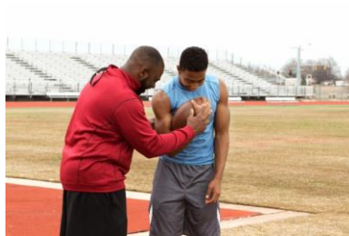
Parents of teens: Watch, listen and act