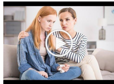
Ask an Expert video: Listening to your teen

Sign up or log in to EveryParent today for even more expert parenting advice!