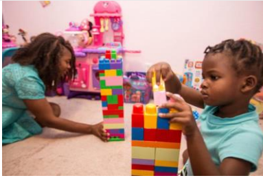
Ready for kindergarten?