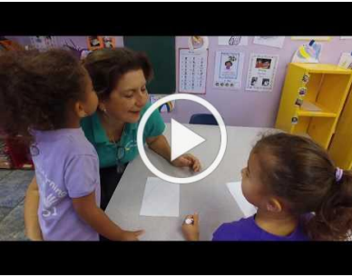
VIDEO: The benefits of voluntary pre-kindergarten